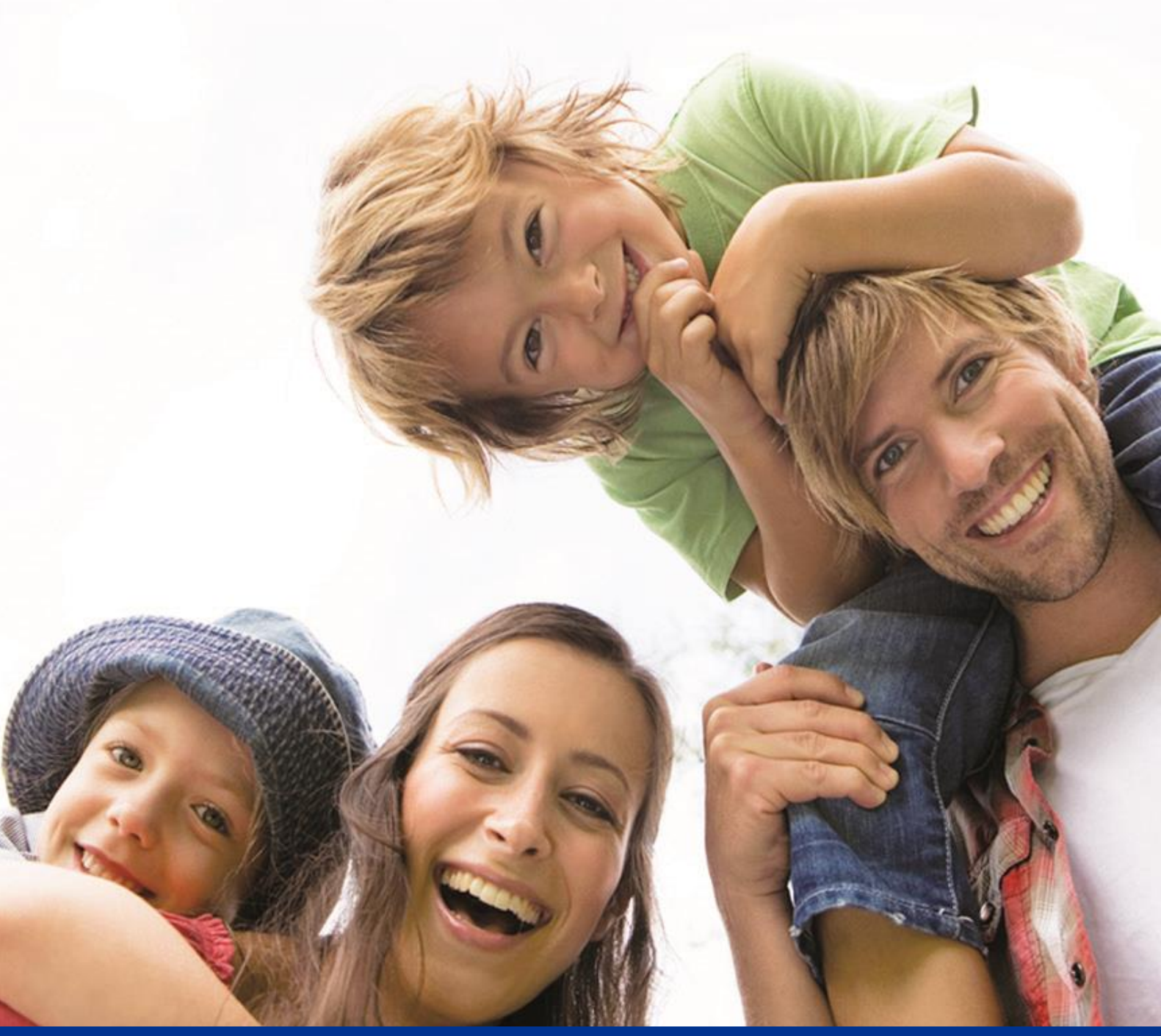
INTERNATIONAL EXPAT INSURANCE PACKAGE Application Form